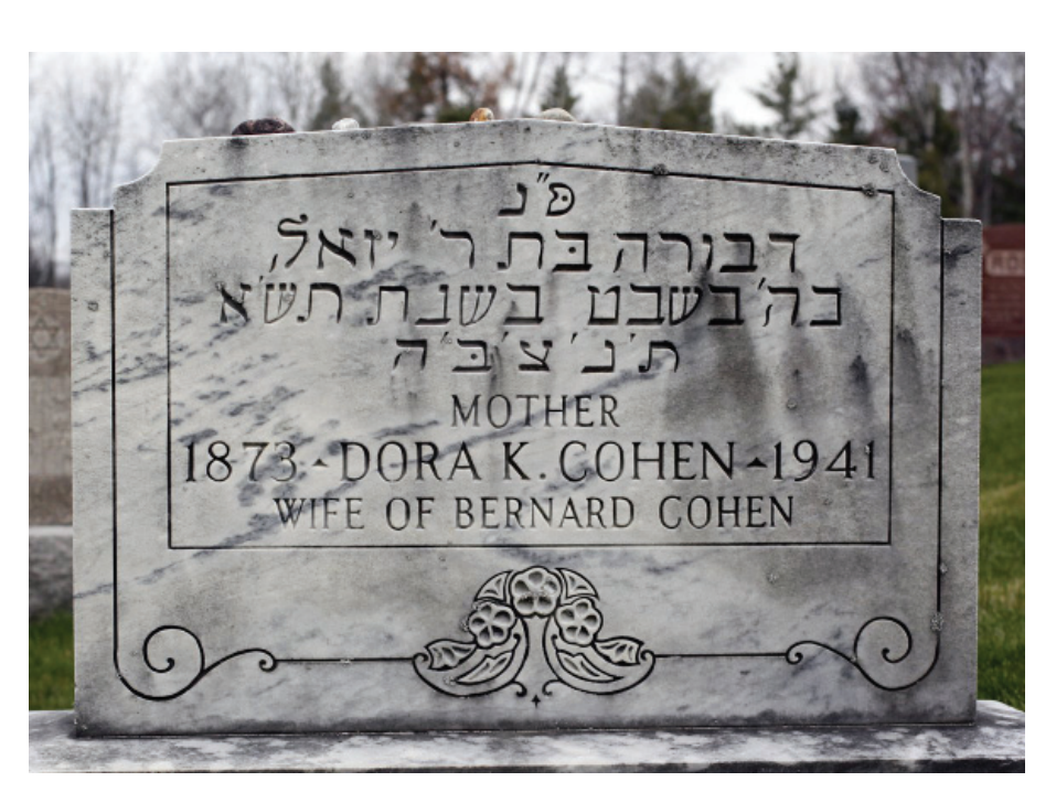
Dvora daughter of Yoel